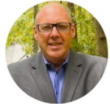
WILLIAM HEARN SITE DYNAMICS LLC